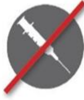
No Sharp Objects