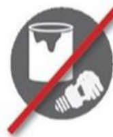
No Hazardous Waste